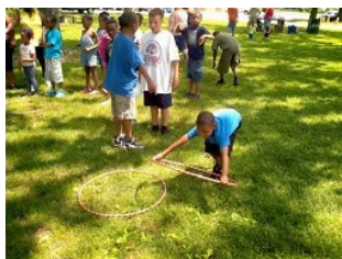
2013 Outreach Picnic

"The community is invited for a day of fun, great free food, kids games, laughter and fellowship..."