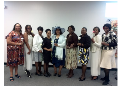
The Women of TCC

"ONE MEMBER LOGGED IN AT THE NEW JERSEY AIRPORT TO DO HER BIBLE READING WHILE WAITING FOR HER FLIGHT BACK TO MICHIGAN. "