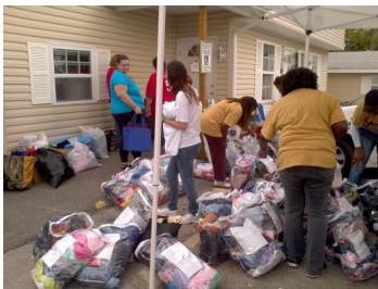
TCC & Fields of Hope

Let your light shine before others so that they may see your good works and give glory to your Father who is in heaven.” Matthew 5:16