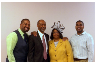
The Woodmore Family