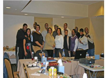
Trinity's First Marriage Retreat March 9 - 10, 2012